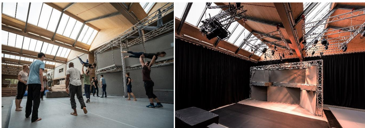
Motionhouse creation space in the Vitsoe building