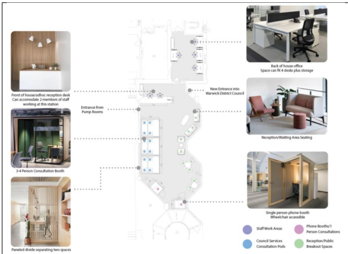
Figure 3. The Proposed Customer Service Centre Layout.

A larger version of this image is included in Appendix 2 – Design Concept.