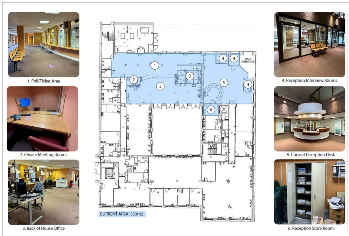
Figure 1. The Interior of Riverside House

Customer Service facilities at Riverside House have not seen any significant updates for a long time. They do not meet the requirements of a modern customer service location.