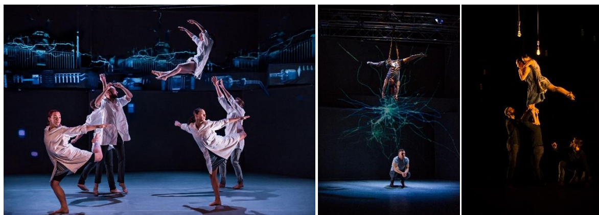
Motionhouse dancers perform touring production Charge

We believe that arts engagement is a powerful means of communication as well as self-expression with participation in the arts having a strong capacity for helping build both self-esteem and empathy, as stated by the Arts Council England's Be Creative Be Well report. The arts have a measurable impact on individual health and well-being with dance in particular encouraging young people to be physically active, which is vital in light of the an obesity crisis.