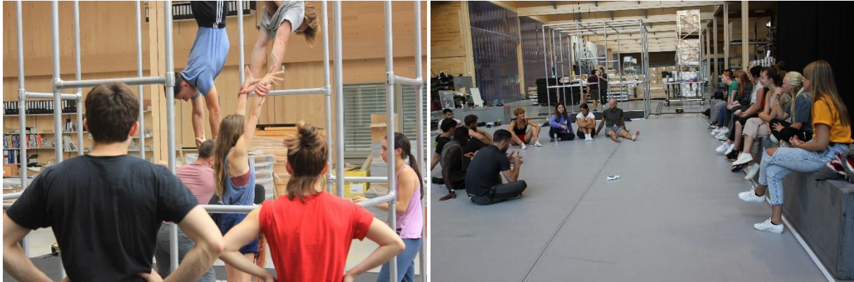
Young dancers attend a training course with Motionhouse dancers at Vitsoe

We offer regular term-time classes and holiday intensives for children aged 8-18, with new classes starting in the new year for people over 60 and children from as young as 2 years old with their families. Classes are suitable for all abilities and take place in our studio in Spencer Yard, Leamington Spa. Young people have the chance to explore our style, learn new dance skills and make up their own moves. Classes are informal, energetic and fun and open to anyone with an interest in dance, no matter what level of experience. A new creation space in the Town Hall would enable us to further develop our offer for families and young people from the local area.