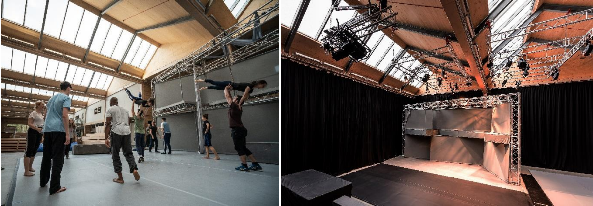
Motionhouse creation space in the Vitsoe building