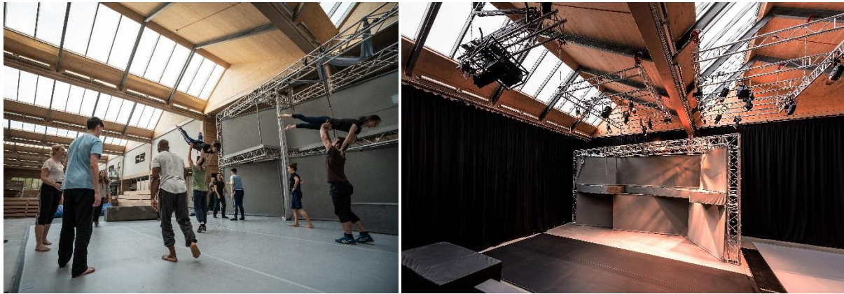
Motionhouse creation space in the Vitsoe building