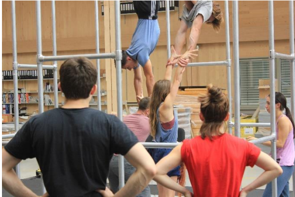
Young dancers attend a training course with Motionhouse dancers at Vitsoe

We offer regular term-time classes and holiday intensives for children aged 8-18, with new classes starting in the new year for people over 60 and children from as young as 2 years old with their families. Classes are suitable for all abilities and take place in our studio in Spencer Yard, Leamington Spa. Young people have the chance to explore our style, learn new dance skills and make up their own moves. Classes are informal, energetic and fun and open to anyone with an interest in dance, no matter what level of experience. A new creation space in the Town Hall would enable us to further develop our offer for families and young people from the local area.