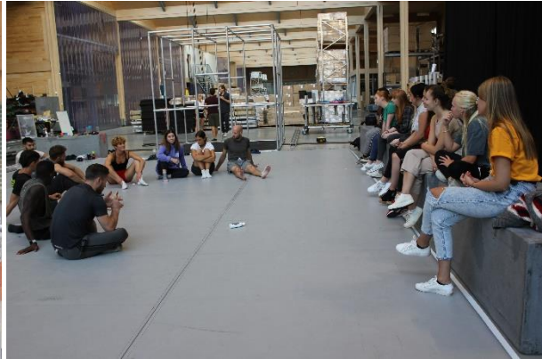
Young people have a Q&A with Motionhouse dancers after watching rehearsals