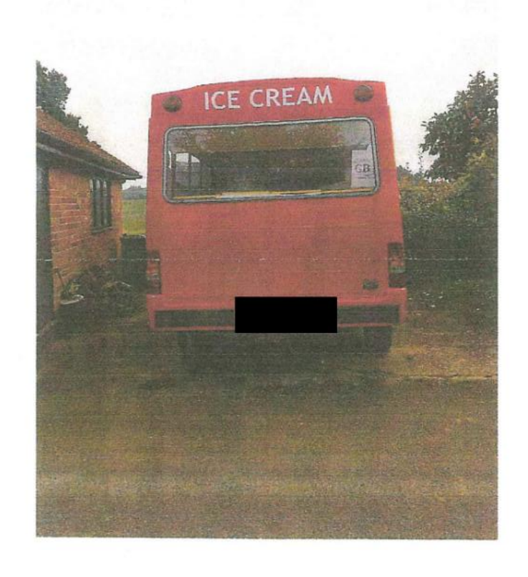
Item 4 / Page 8