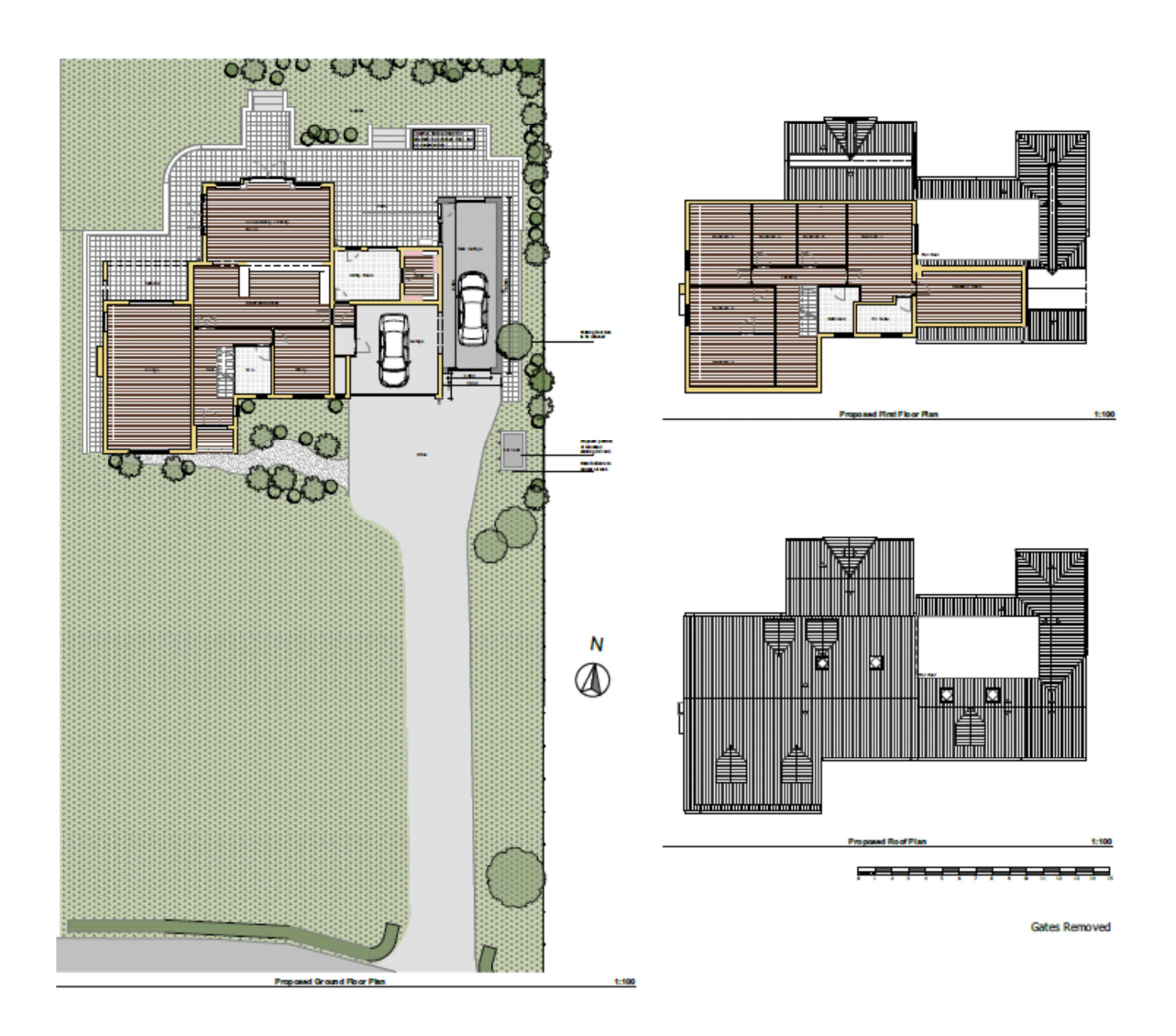
Item 7 / Page 7