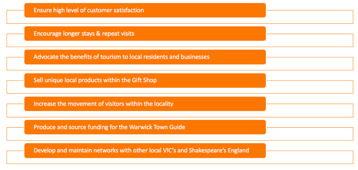
Figure 1 – Current Offering Matrix

WVIC has been successful since the refurbishment, although it is recognised that the Tourism sector is facing difficult challenges through changing customer attitudes and behaviours and the increasing popularity of online bookings and tourism guides. A summary of just some of the key service provision is indicated within Figure 1. As such, WVIC is seeking to continue to respond to the changing sector and challenges facing tourism to ensure WVIC remains a relevant hub which has a diverse offering.