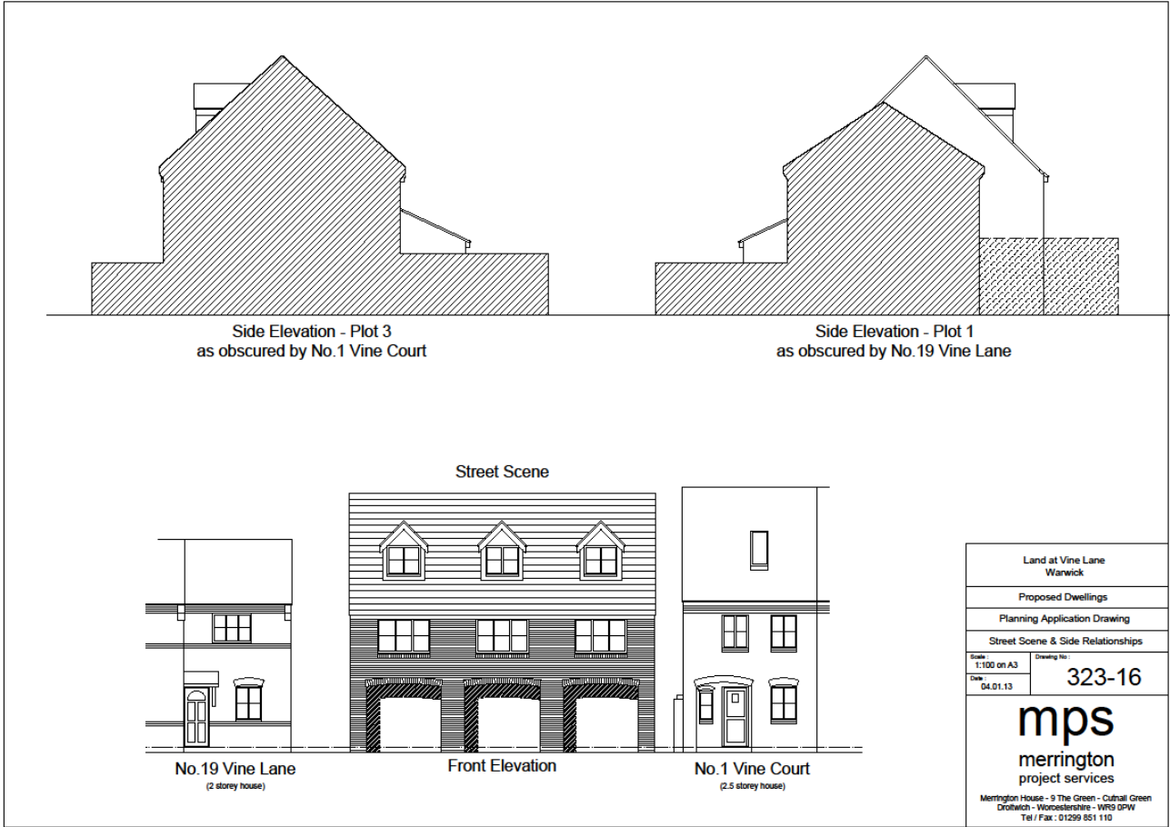
Side Elevation - Plot 3 as obscured by No. 1 Vine Court