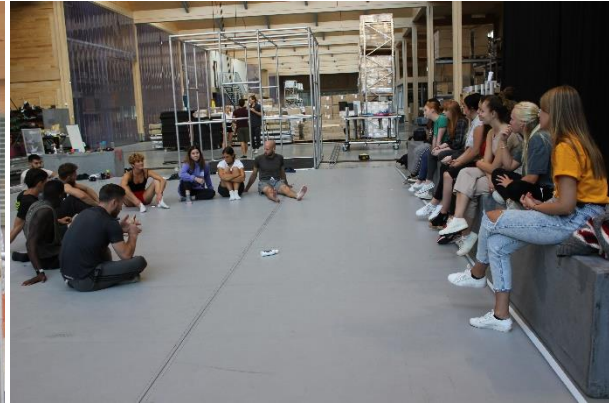
Young dancers attend a training course with Motionhouse dancers at Vitsue