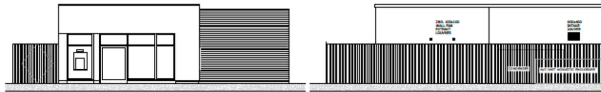
DELIVERIES PROPOSED PLANT AREA FRONT ELEVATION - SCALE 1:50