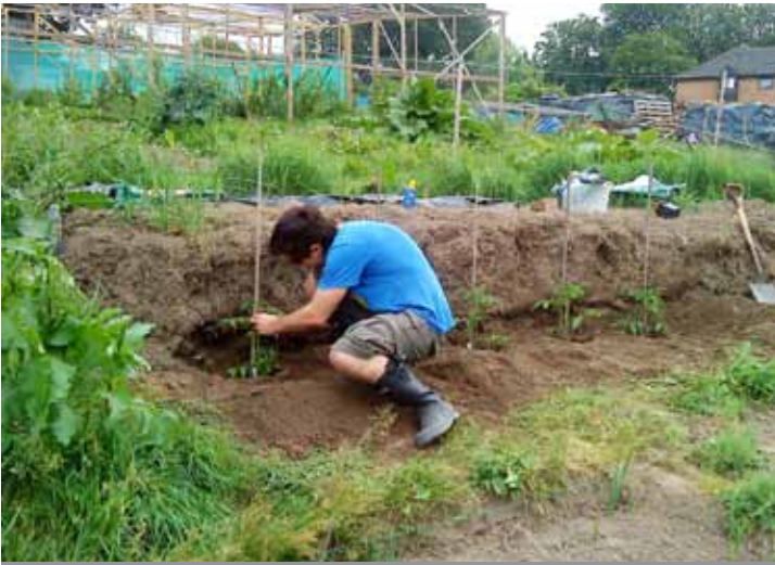
Opportunities for residents to grow their own food