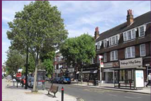
District centre in Brentham Garden Suburb