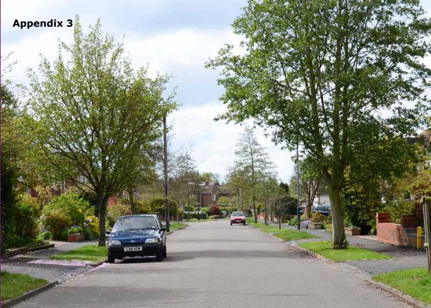
Elmdene Road, Leamington Spa