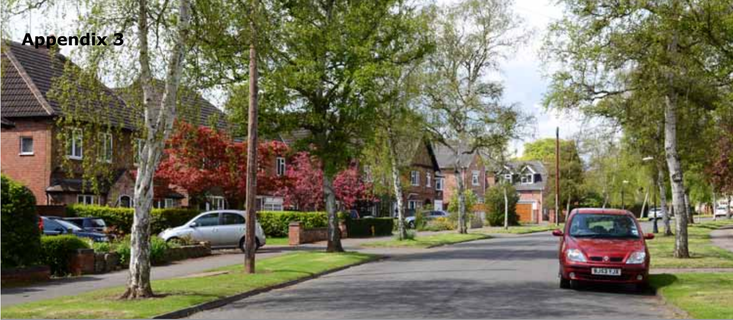
A typical Garden Suburb street