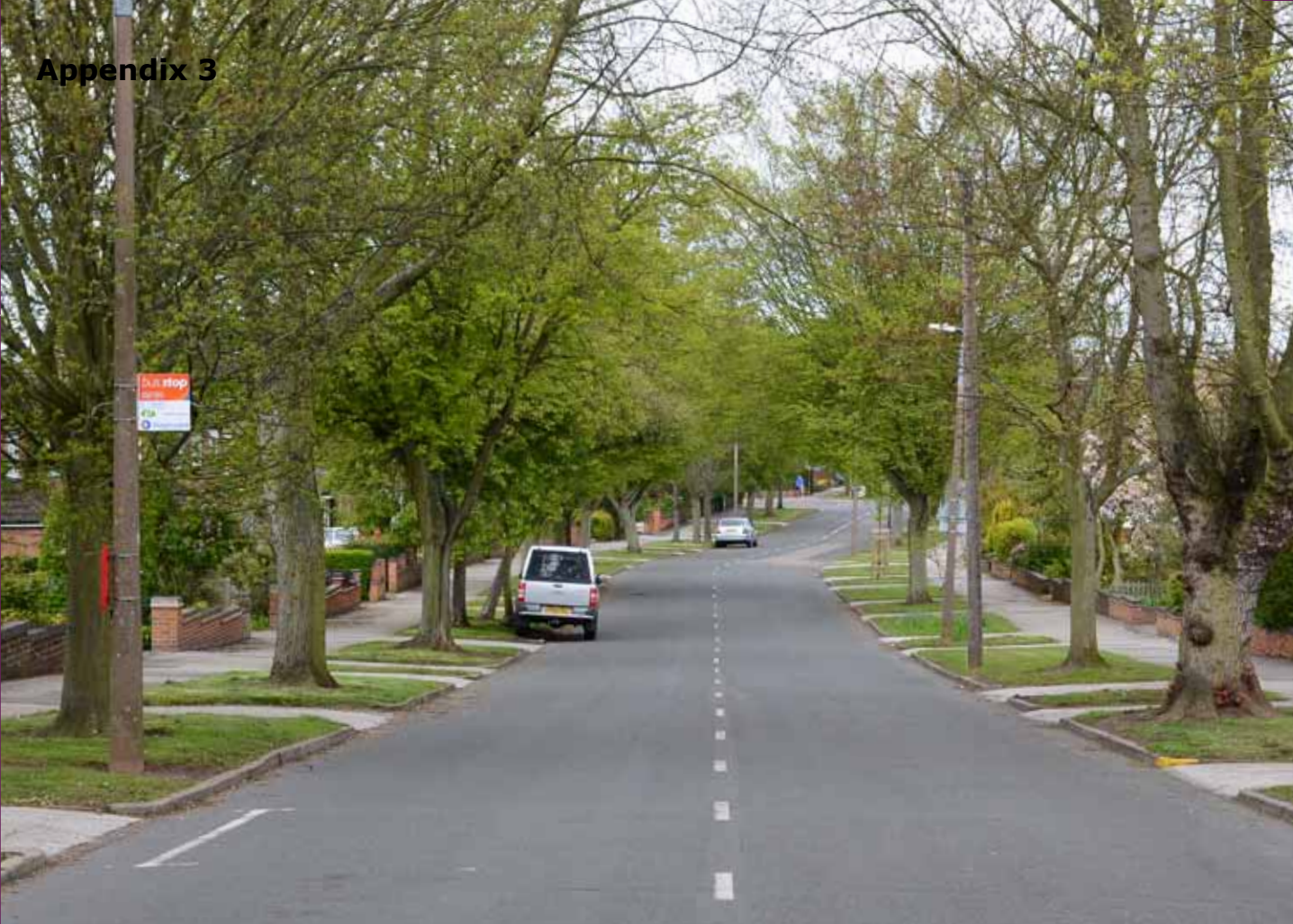
Telford Avenue, Leamington Spa