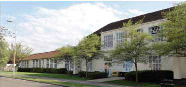
Civic and community buildings and infrastructure instil a strong sense of identity and community.