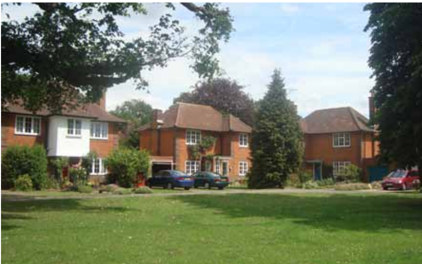
The Quadrangle, Welwyn Garden City

Letchworth and Welwyn Garden Cities demonstrated how completely new communities could be planned and developed following Howard's vision. They included not just new homes, but also industry, services, shops, community facilities and open space. Surrounding each town was a 'green belt' of agricultural land intended to separate the town from other communities and to provide for local food production.