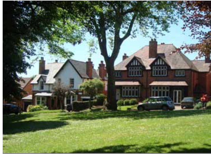
Homes set within a greener and more spacious environment