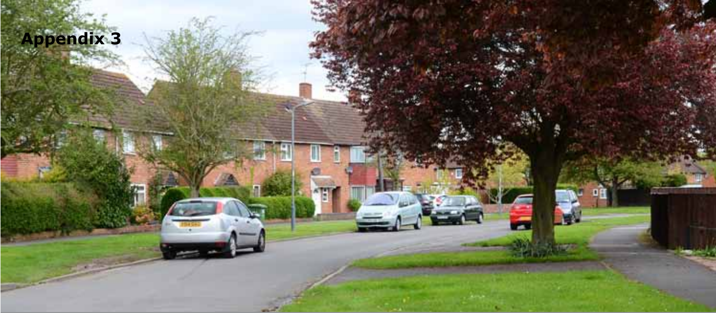
A typical Garden Village street