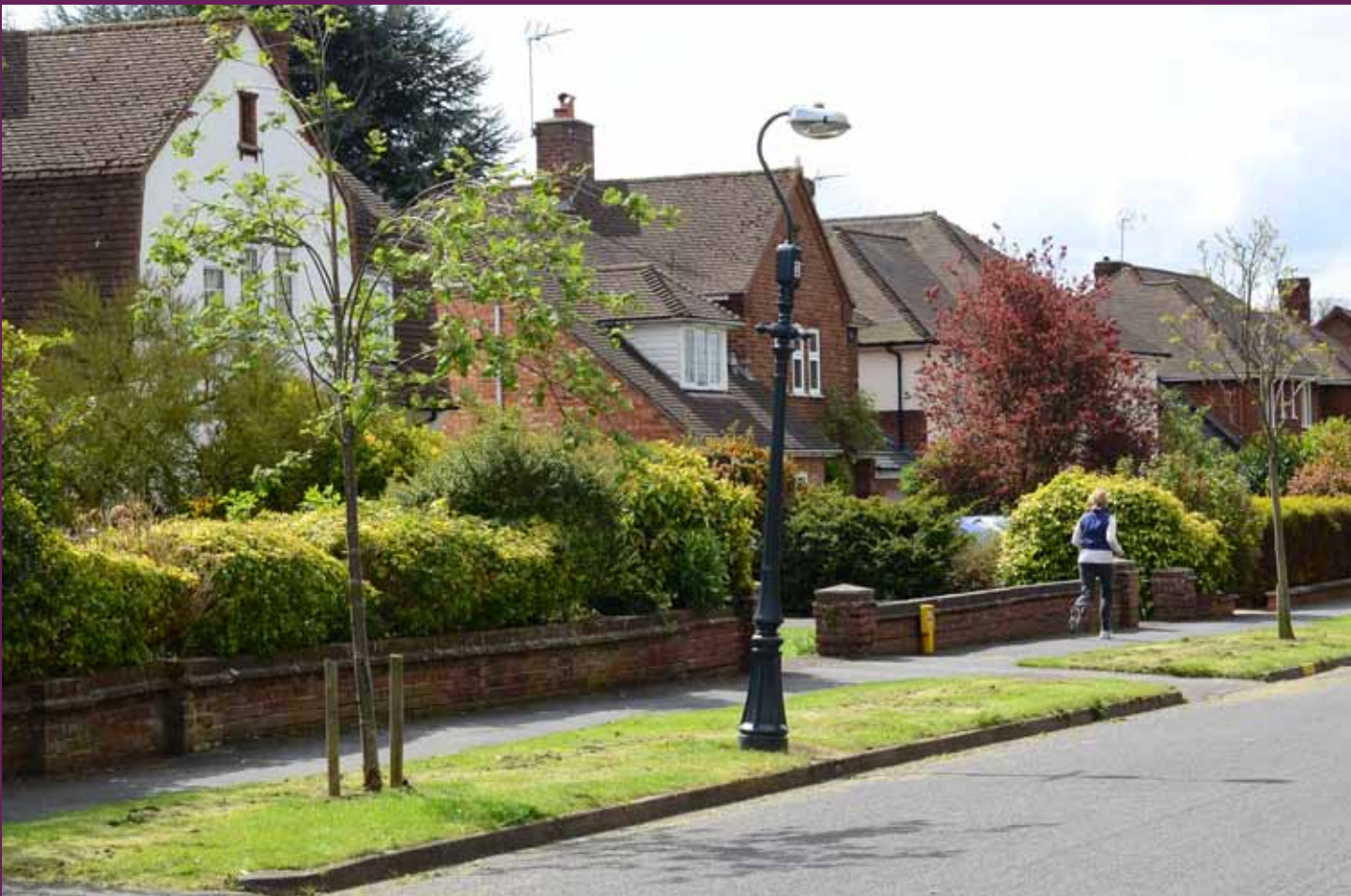
Avenue Road, Leamington Spa