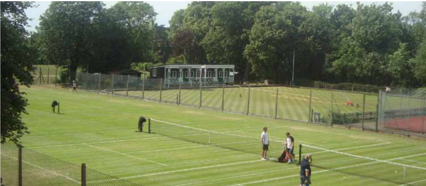
Facilities and open spaces that add to the quality of life for existing and new residents