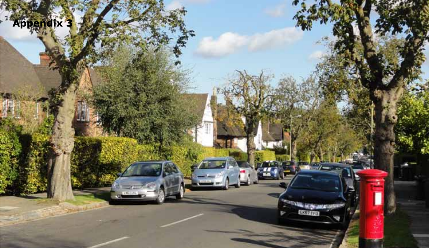
Hampstead Garden Suburb

Garden City planning principles were also applied in the design of numerous Garden Suburbs such as at Hampstead and Brentham, as well as in a number of smaller Garden Villages. The same principles were applied in the development of a number of neighbourhoods across Warwick District. These places have succeeded in meeting the housing aspirations of successive generations and remain popular today. In many cases the special character and quality of the areas is recognised by Conservation Area designation.