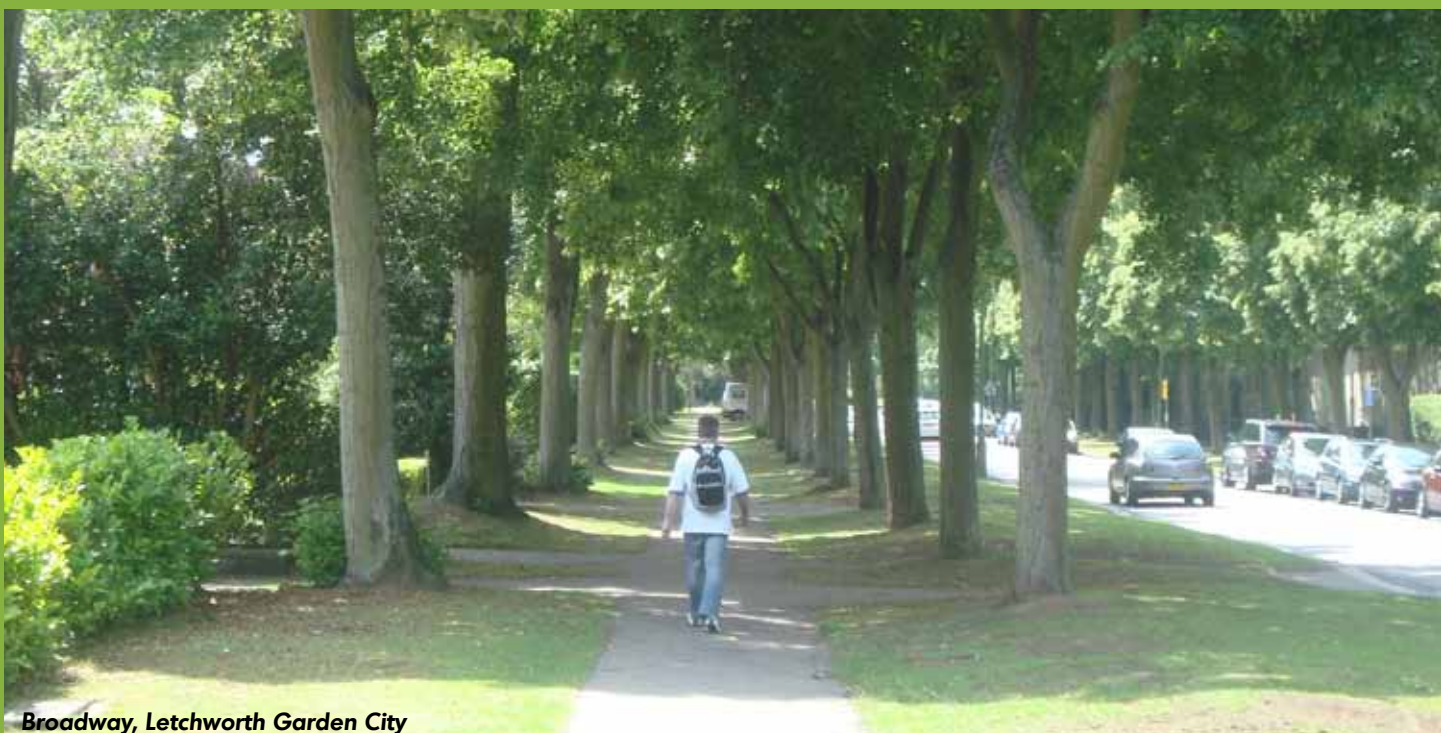
Broadway, Letchworth Garden City

The following sections set out some of the enduring qualities of the approach, consider some of the key characteristics of Garden Suburbs and Villages and present some of the more detailed planning and urban design principles applicable in a range of different contexts.