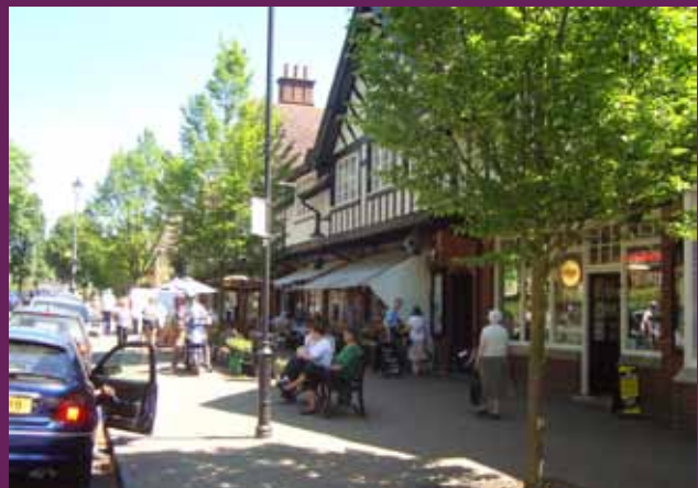
Local centre at Bournville