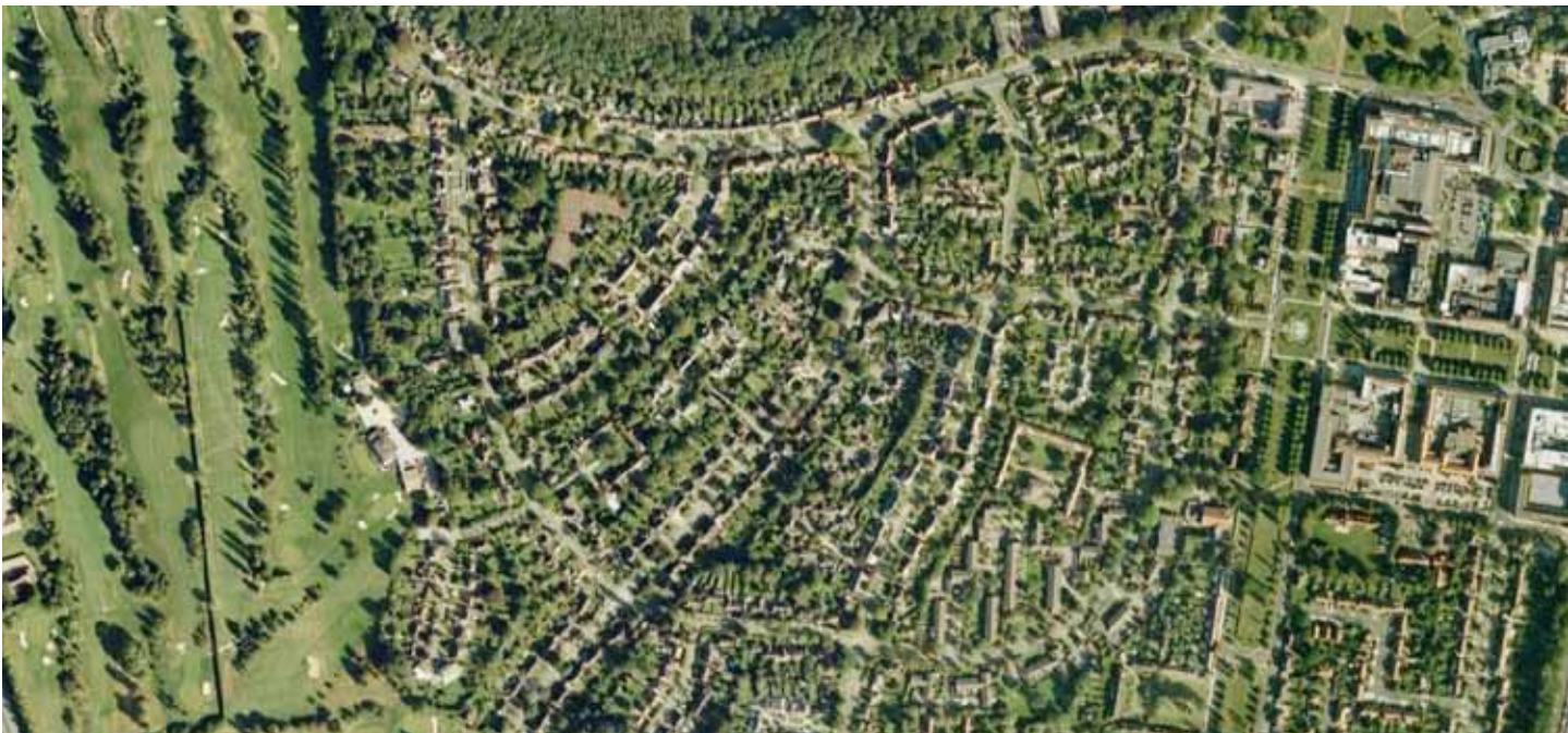
Welwyn Garden City

The concept was developed by Ebenezer Howard as a new way of creating communities that combined the best of town and country living. The principles were first applied in the design of Letchworth and Welwyn Garden Cities. This represented a golden age in British town planning and was admired and emulated around the world.