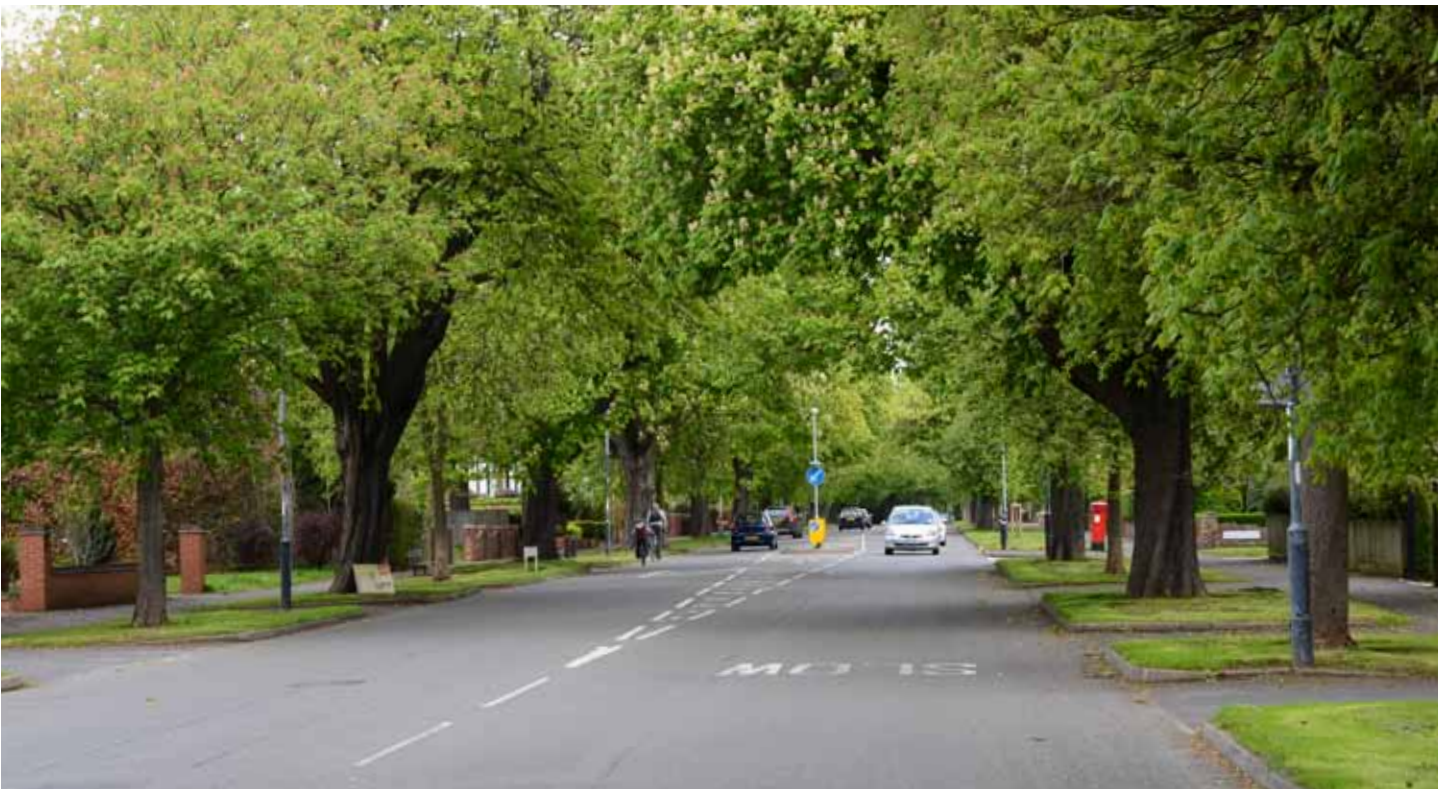
Northumberland Road, Leamington Spa

Garden City planning principles were also applied in the design of numerous Garden Suburbs such as at Hampstead and Brentham, as well as in a number of smaller Garden Villages. The same principles were applied in the development of a number of neighbourhoods across Warwick District. These places have succeeded in meeting the housing aspirations of successive generations and remain popular today. In many cases the special character and quality of the areas is recognised by Conservation Area designation.