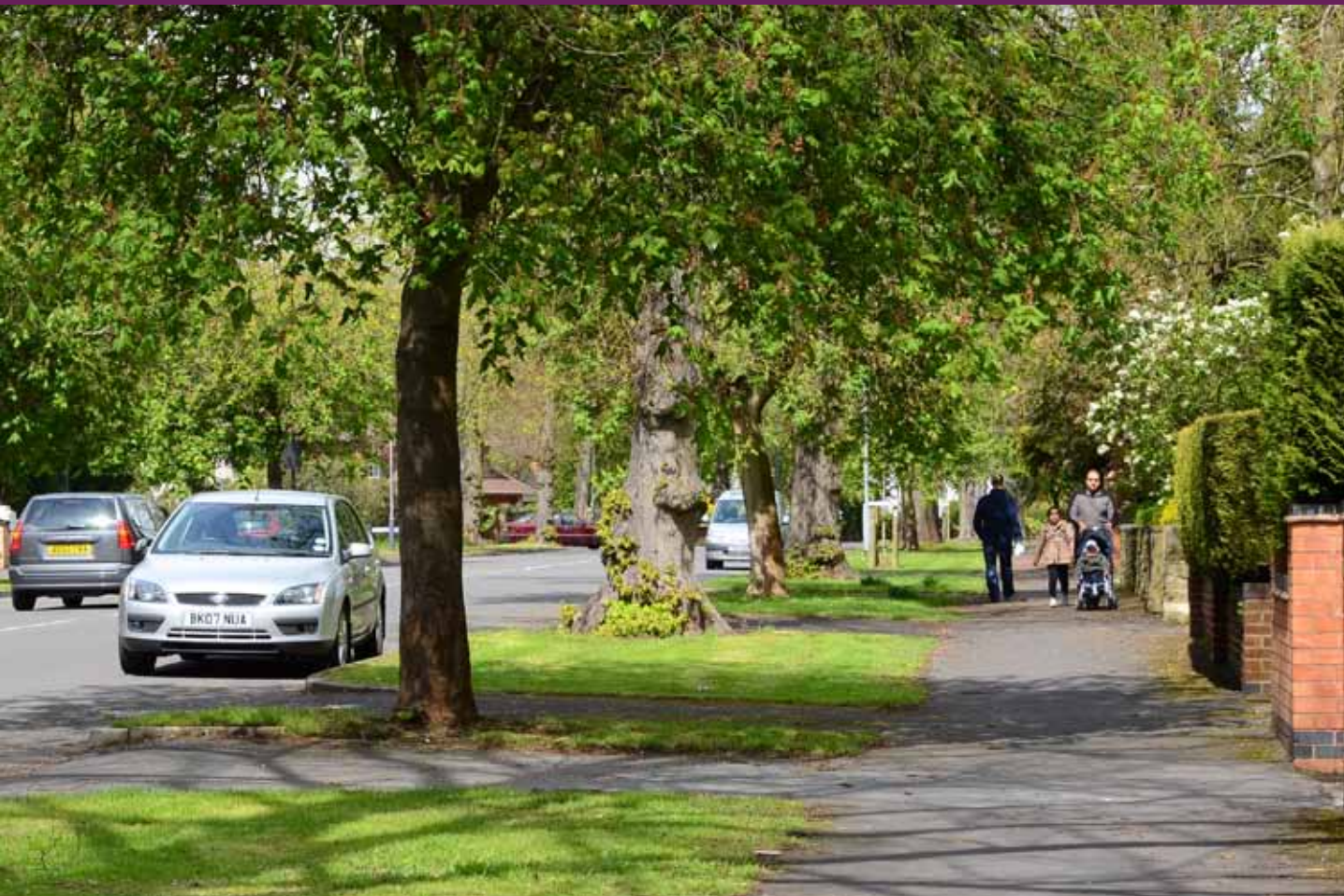
Northumberland Road, Leamington Spa