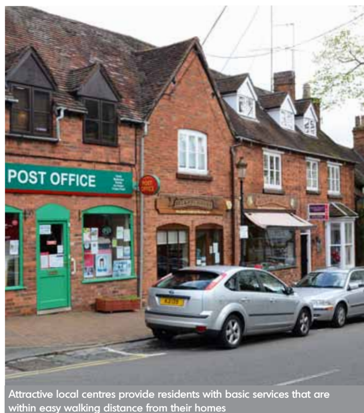
Attractive local centres provide residents with basic services that are within easy walking distance from their homes