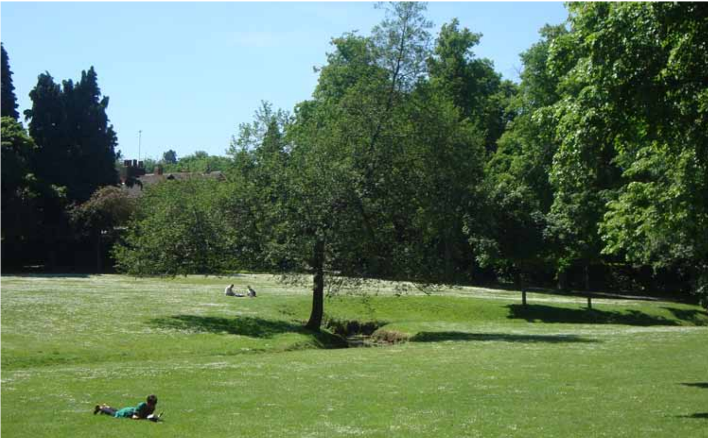
Improving the quality of life - reaping the benefits of outdoor living