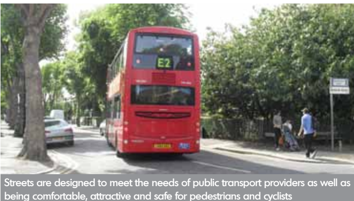
Streets are designed to meet the needs of public transport providers as well as being comfortable, attractive and safe for pedestrians and cyclists