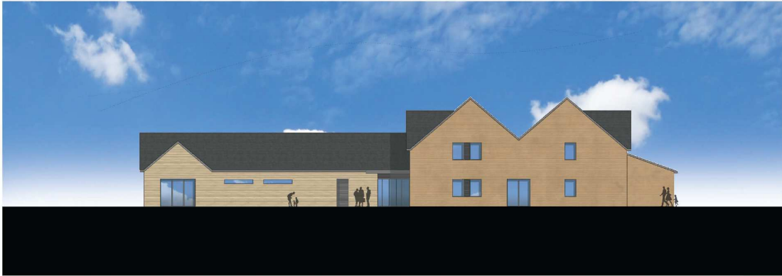
02 West Elevation

The rendering of this plan and elevation is intended to provide a visual representation of the proposed project. It is not intended to be used for construction purposes. All construction shall be in accordance with the approved plans and specifications. The rendering is not intended to be used for any other purpose. All construction shall be in accordance with the approved plans and specifications. The rendering is not intended to be used for any other purpose.