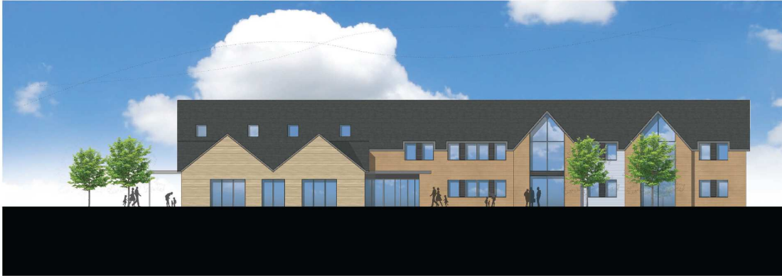
01 North Elevation