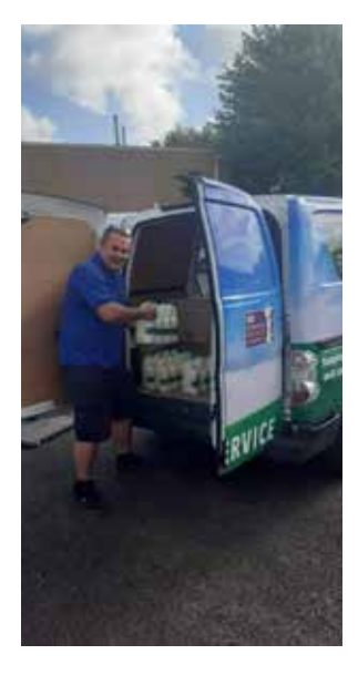
Additional Item / Appendix 5 / Page 2