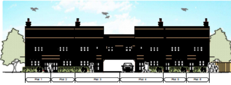
Street Elevation • Front