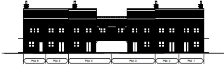
Elevation • Rear