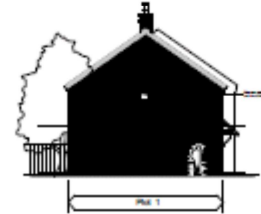
Elevation • Side