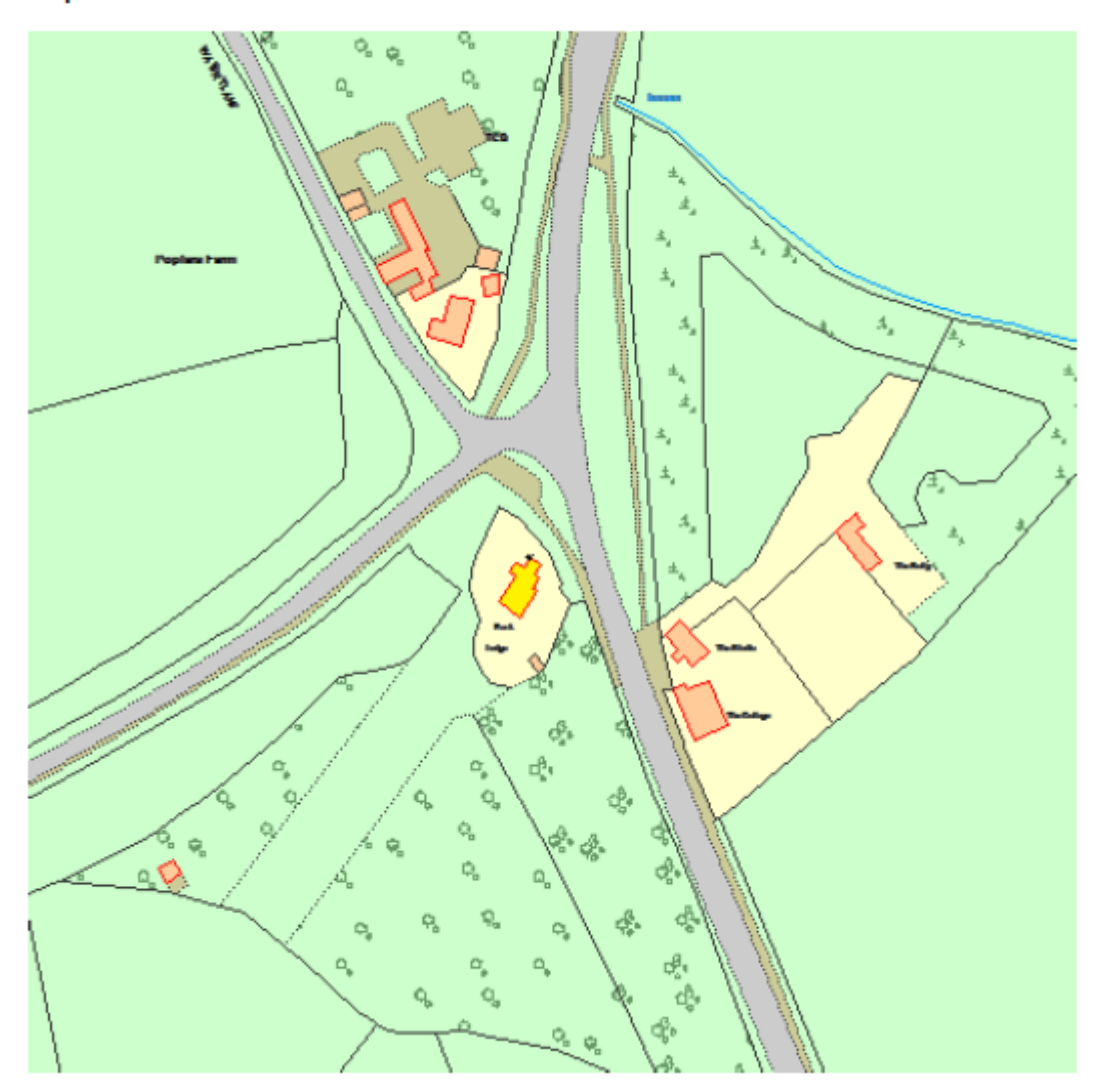
END OF NOTICE