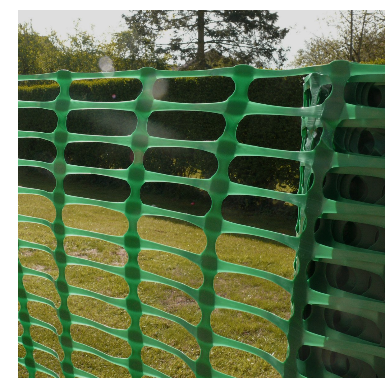
Proposed Seasonal Barrier.