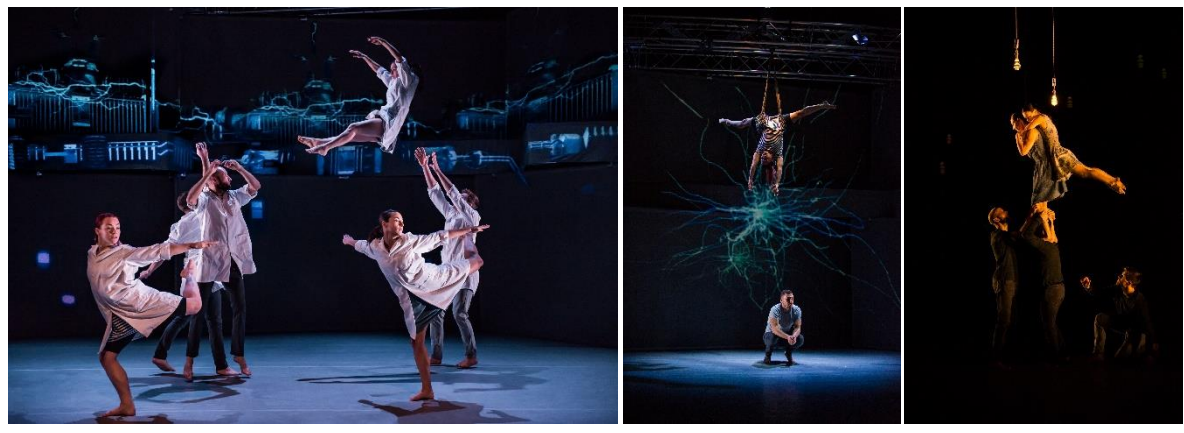
Motionhouse dancers perform touring production Charge

We believe that arts engagement is a powerful means of communication as well as self-expression with participation in the arts having a strong capacity for helping build both self-esteem and empathy, as stated by the Arts Council England's Be Creative Be Well report. The arts have a measurable impact on individual health and well-being with dance in particular encouraging young people to be physically active, which is vital in light of the an obesity crisis.