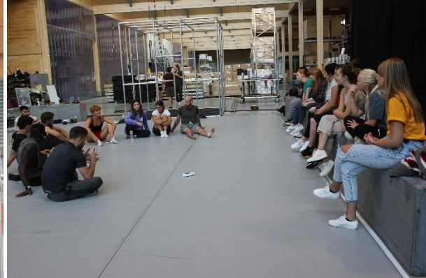
Young dancers attend a training course with Motionhouse dancers at Vitsue