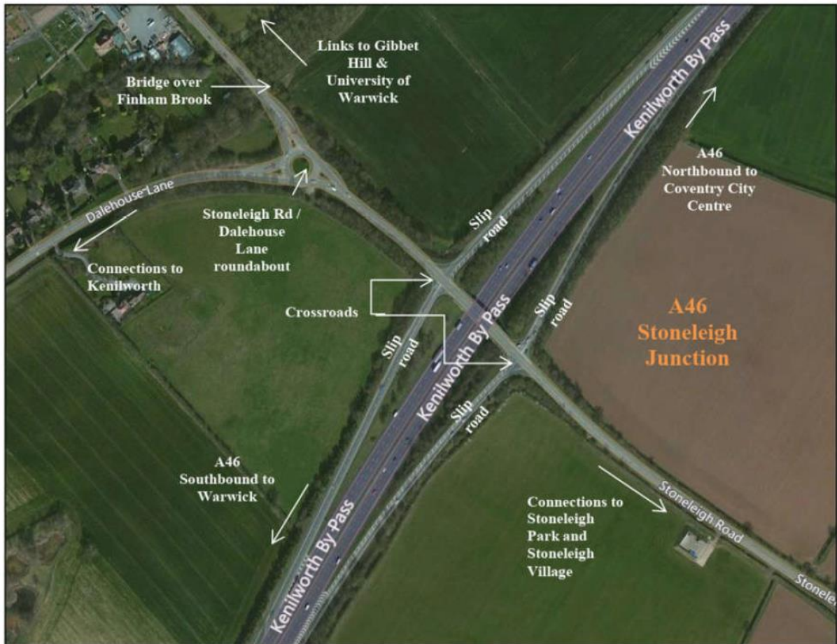
Figure 1: Annotated aerial photograph of junction before works