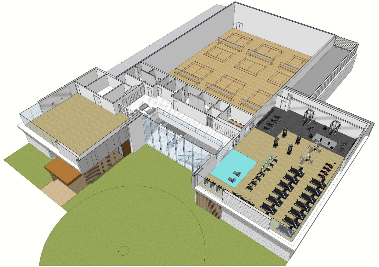
Item 7 / Appendix D / Page 1